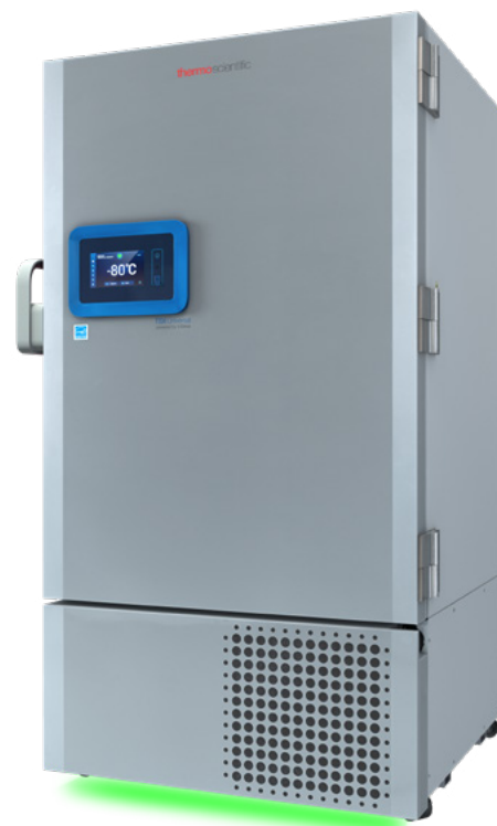
Figure 1. TSX Universal Series ULT freezer

The TSX Universal Series ULT freezers (Figure 1) feature our next-generation Universal V-drive adaptive control technology, designed to minimize energy consumption without sacrificing sample security. While conventional ULT freezers use single-speed compressors that continually cycle on and off, the V-drive runs the compressors at variable speeds, adjusting cooling performance to the cooling demands inside and outside the freezer. When conditions are stable, the V-drive controls the system at low speed, which helps reduce energy consumption while maintaining a stable temperature for sample protection. When there are frequent door openings or samples being added to the freezer, the system detects the activity and increases the drive speed. Additionally, the TSX Universal Series ULT freezers operate at under 44 dB, a noise level similar to that of a library [1]; this allows them to be located conveniently inside the lab.