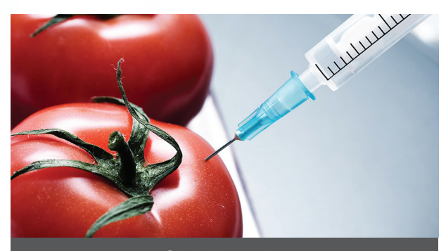
Shelf life testing