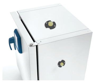
Access ports on the top and side of the unit